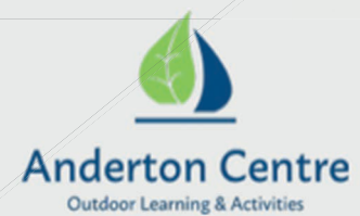
HILL AND MOORLAND LEADER