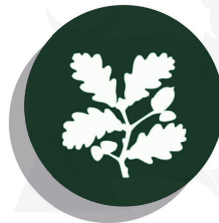
WELSH NATIONAL TRUST